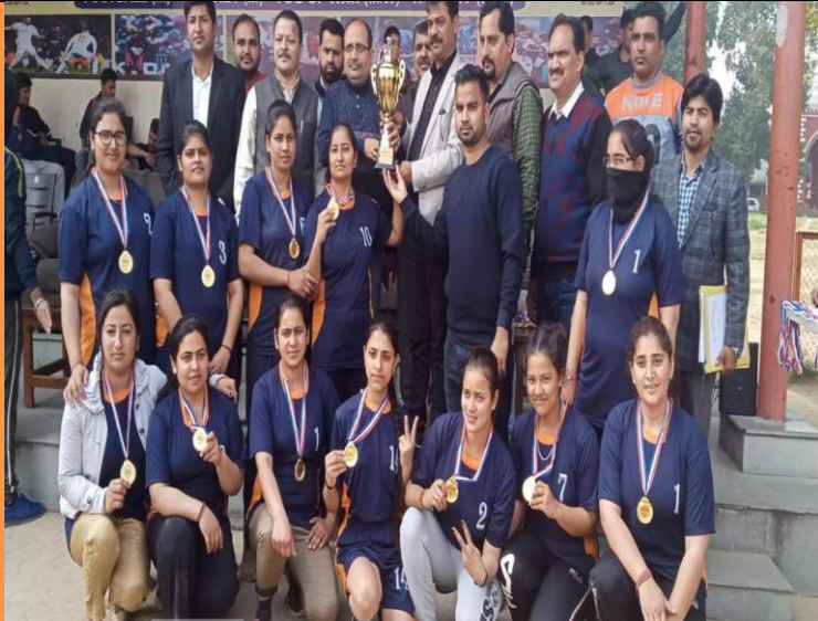
Winners of Women "Tug of War" Trophy, Zone - A (Jammu Region) in Sports Fest 2020 organized by Department of Higher Education, Jammu & Kashmir