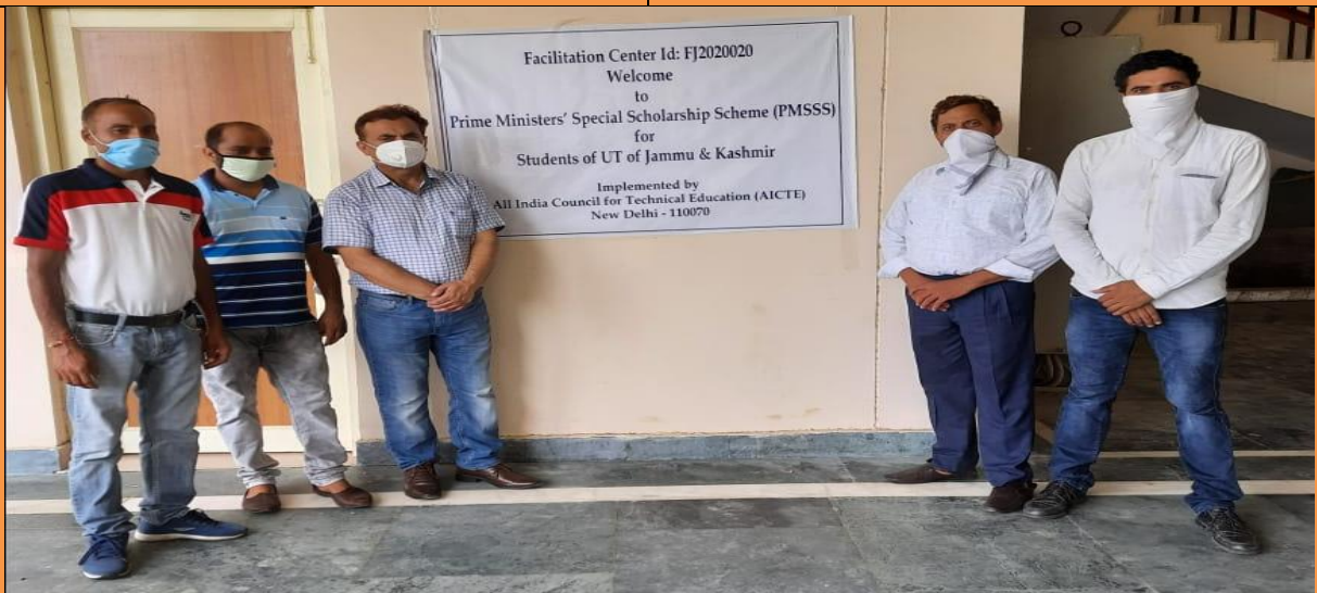
PMSSS Facilitation/Verification Centre Principal, Coordinator & Members of PMSSS Committee