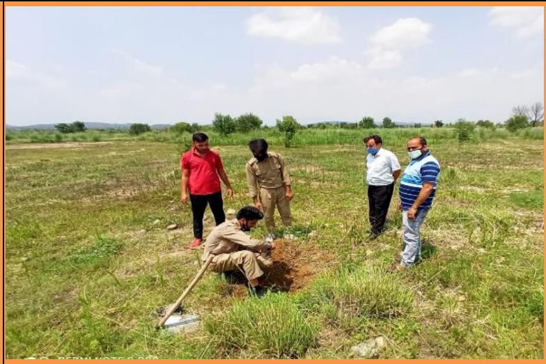
NCC Cadets planting sappling