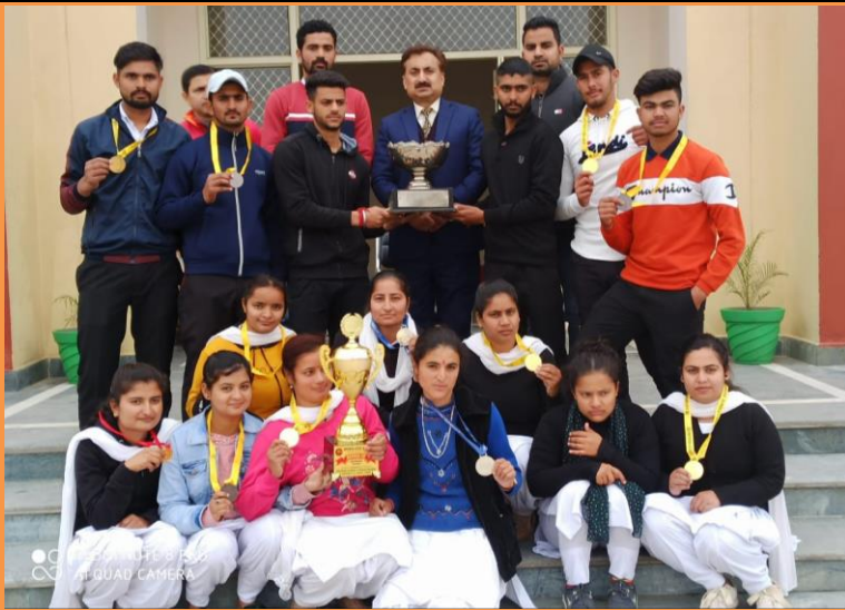
Felicitation of Medalists in Inter Collegiate Wrestling Championship 2019-20