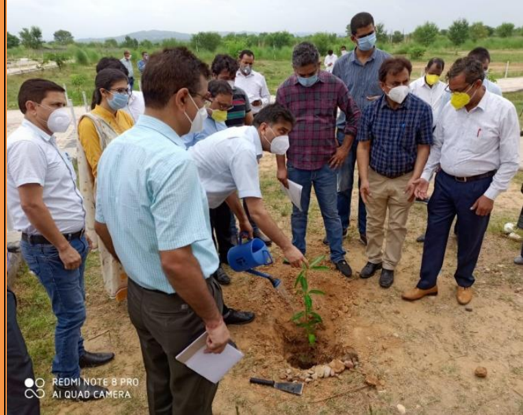
Commissioner Secretary inaugurating 03 days plantation drive at GDC Khour