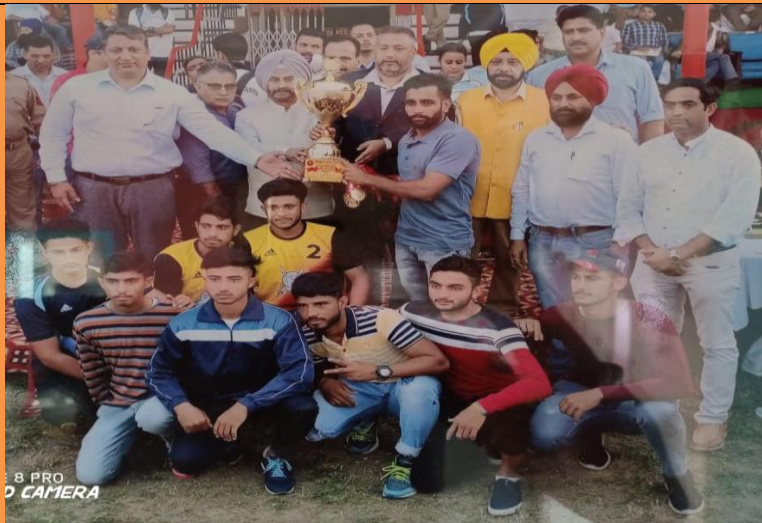
Kabaddi Team of GDC Khour won Championship in Men section at Sports Fest 2019 - 2020 organized by University of Jammu