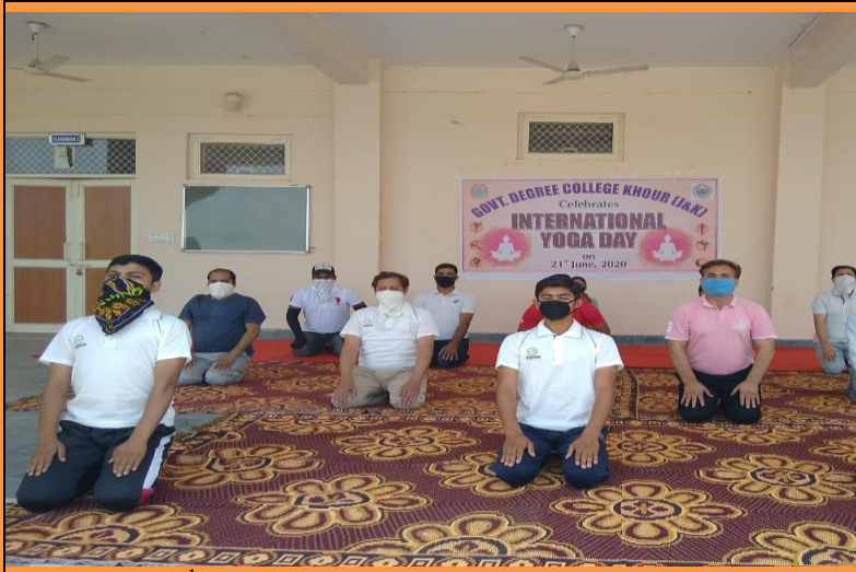
6 th International Yoga Day Celebration