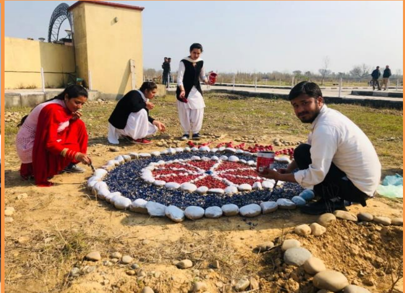
NSS activity during 07 Day Winter Camp