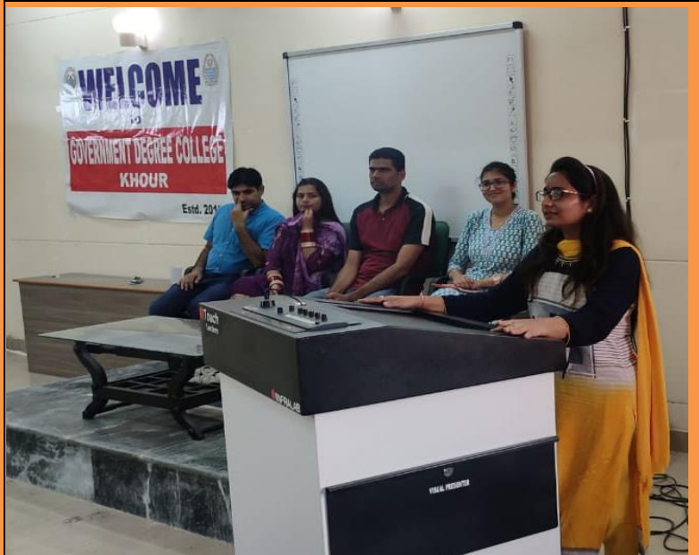
Two Day NSS Orientation Programme