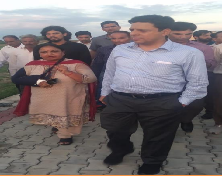
Visit of Divisional Commissioner, Sh. Sanjeev Verma, 2019