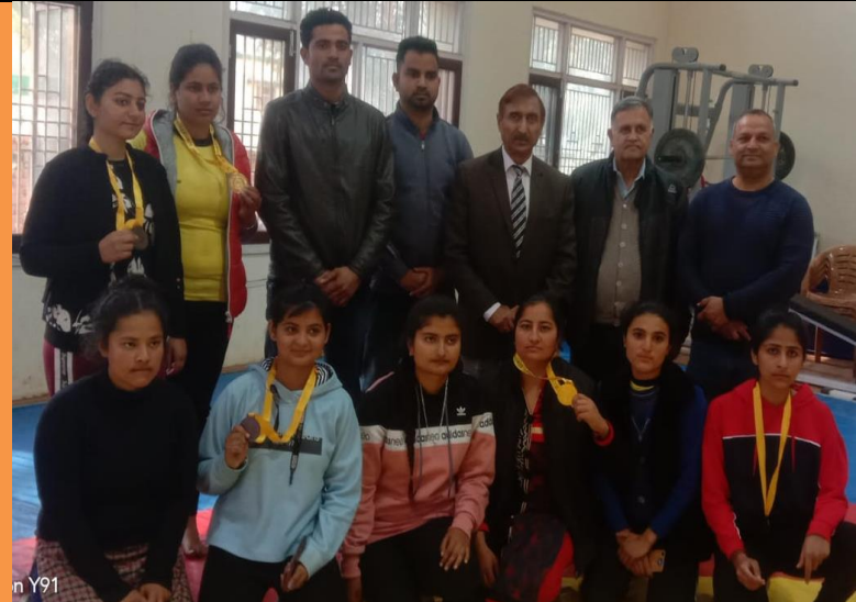
Medalists in Inter-Collegiate Judo Championship Women 2019-2020