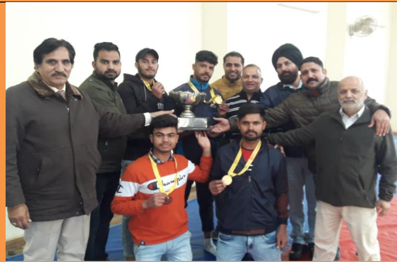
GDC Khour won overall Championship in Inter-Collegiate Wrestling Men competition 2019 – 2020