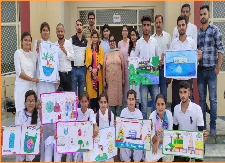
Students displaying posters made during competition on the theme “Say No to Plastics”