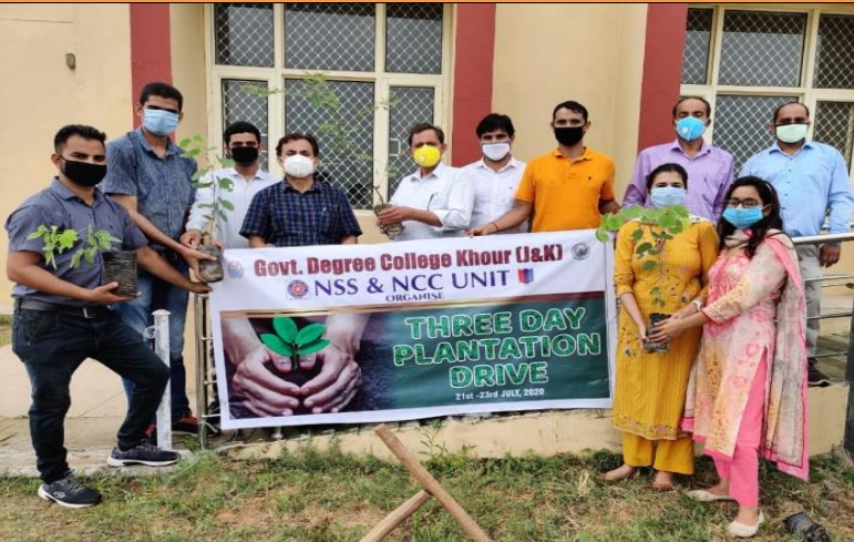
Principal & Staff planted around 100 saplings in the college premises during 3 days plantation drive.