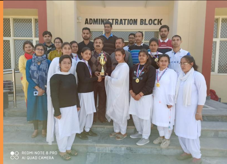
Principal along with Staff Felicitating the winners of Women "Tug of War" Trophy