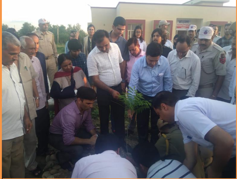
Div. Com Jammu planting a sapling in the college campus