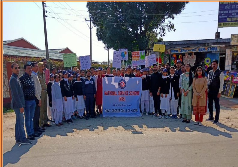
Rally by NSS Volunteers on “Say No to Single Use Plastics” at Khour Bazar