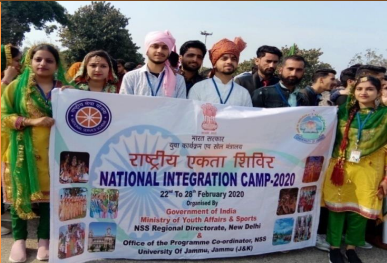
NSS Volunteers of GDC Khour participated in NIC held at University of Jammu & Youth Festival at Lucknow 2020 organized by Ministry of Youth Affairs & Sports