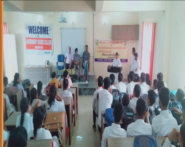
Students participating in symposium organised by Department of Hindi, GDC Khour, in collaboration with Jammu & Kashmir Rashtriya Bhasha Prachaar Samiti on Hindi Diwas